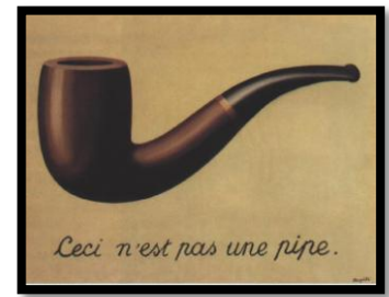
"This is not a pipe"