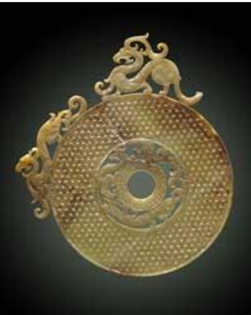
Bi with Dragons c. 4 th c. BCE nephrite Zhou Dynasty