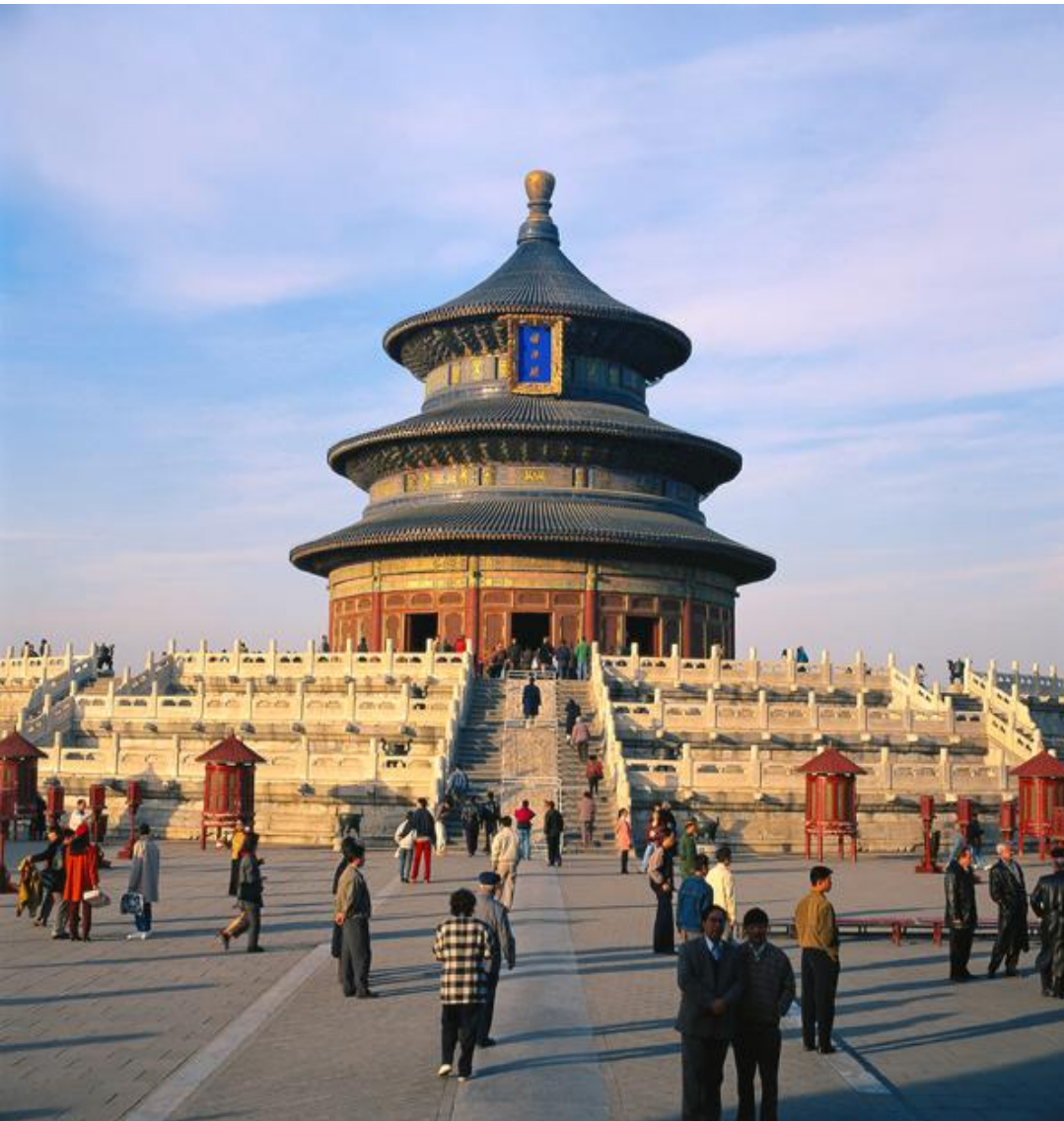
Temple of Heaven Pagoda c. 15 th c. CE Sandstone Beijing, China