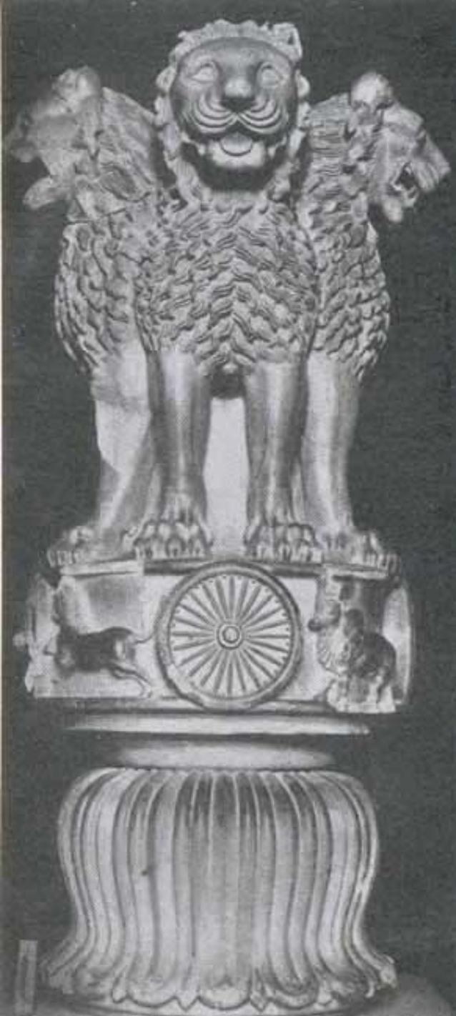
Lion Capital from Sarnath c. 250 B.C.E. sandstone