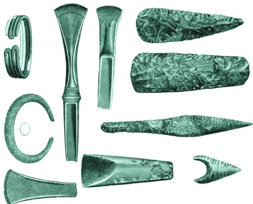
ancient tool examples

INTERNET RESEARCH: collage/ draw 8 or more "prehistoric tools", "artist's tools", contemporary hardware tools, in the space below.